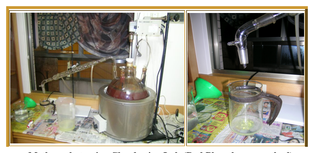
Methamphetamine Clandestine Lab (Red Phosphorus method)