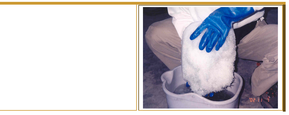
Methamphetamine Clandestine Lab (EMDE method)