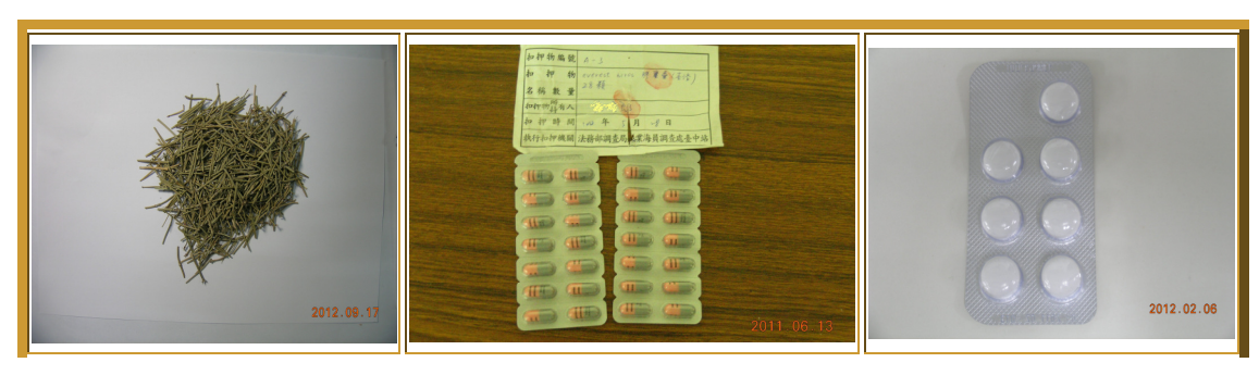
Ephedra Capsules for cold Tablets for cold

All of the (pseudo)ephedrine clandestine labs seized in Taiwan are responsible for purification of (pseudo)ephedrine. The precursors including tablet (or capsule) for cold and ephedra are extracted by organic solvents and the purified (pseudo)ephedrine can be used for further methamphetamine production.