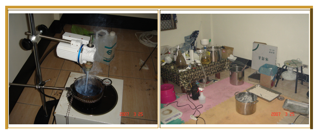
Ketamine Clandestine Lab

The precursors including 1-hydroxycyclopentyl-(o-chlorophenyl) ketone- N-methyl-imine, bromo-(o-chlorophenyl)-cyclopentyl ketone and (o-chlorophenyl)-cyclopentyl ketone are used for manufactures in the ketamine clandestine labs. A great many ketamine clandestine labs emerged until 1-hydroxycyclopentyl-(o-chlorophenyl) ketone-N-methylimine, and (o-chlorophenyl)-cyclopentyl ketone are controlled in Taiwan. Most of ketamine in Taiwan are smuggled at present from Mainland China, India, and Malaysia.