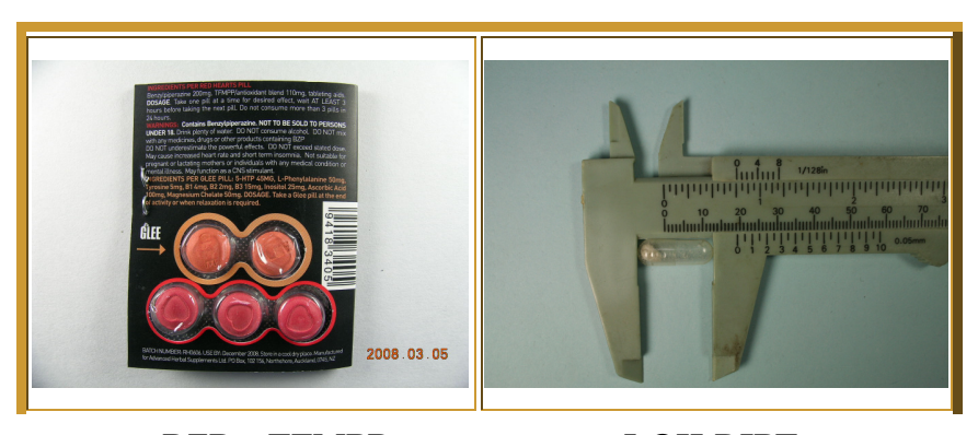
BZP + TFMPP