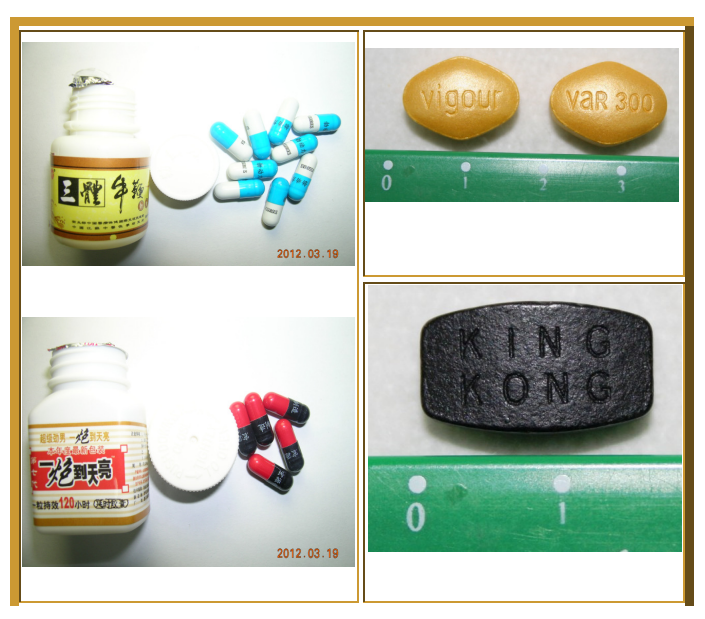
Counterfeit Erectile Dysfunction Drugs

Counterfeit medicines can be easily found on the market and cause more serious citizens' health issue in Taiwan. Three major kinds of medicines including weigh-loss drugs, erectile dysfunction drugs and traditional Chinese medicines are frequently counterfeited in Taiwan. Hundreds of counterfeit medicine cases are sent to this laboratory for analysis each year.