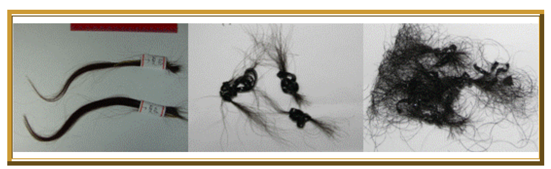
Hair types: Head hair, Axillary hair, Pubic hair

Hair analysis is a reliable indicator of long-term drug abuse. The detectable window can range from months to years, depending on the length of the hair shaft. The detection instruments for hair drug test are based on GC/MS, GC/MS/MS, LC/Ion-Trap MS, and LC/MS/MS etc.