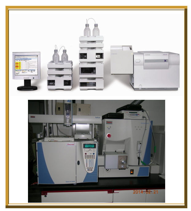
LC/Ion-Trap MS and GC/MS/MS