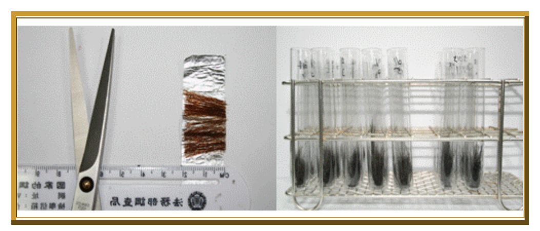
Procedures of segmental analysis for hair samples